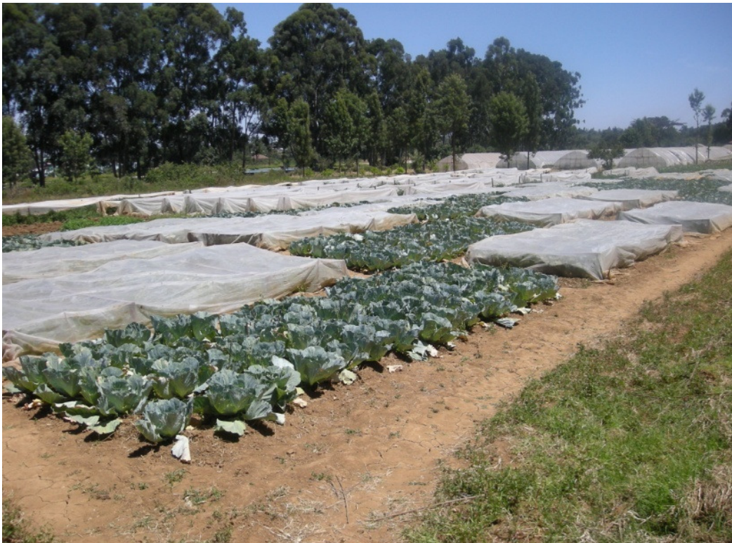
Fig. 1. Layout of the experiment showing agronet covers on the cabbage crop

The field was manually tilled using hand hoes to approximately 20 cm depth and prepared to a fine tilth using rakes. Healthy Gloria F1 hybrid cabbage seedlings produced under agronets were then transplanted at a spacing of 40 cm by 40 cm giving a total of 75 plants per plot. Triple superphosphate (45% P 2 O 5 ) fertilizer was used at planting at the rate of 225kg/ha [16]. Agronets were then mounted on each of the net protected plots immediately after transplanting. A two