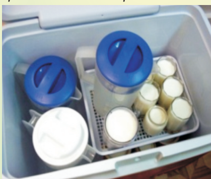
Step 3 –Warm cool box