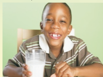
A child served chilled milk