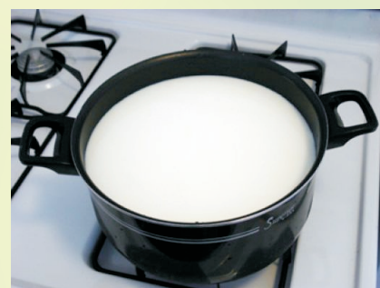
Step 1 – Boil the milk