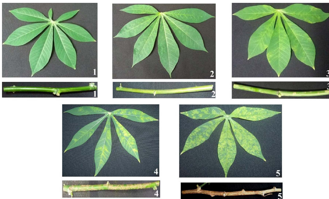
Fig. 1. CBSD symptom severity scale 1–5 used for recording symptoms on cassava leaves. 1 = no apparent symptoms, 2 = slight foliar mosaic, no stem lesions, 3 = foliar mosaic, mild stem lesions no die back, 4 = foliar mosaic and pronounced stem lesions no die back, and 5 = defoliation with stem lesions and pronounced die back.

roots was expressed as percentage of the total root weight. Data were collected on quantitative traits such as root weight in tonnes per hectare, number of roots per plant and dry matter content at 12 MAP.