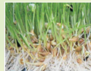
Day 4 - Leaves take form