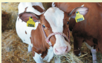
Ear tags on an Ayrshire calf

Before registration, make sure that your animals are well marked for easy identification. An agent of the KLBO can help you mark your animals. Common methods used in cattle identification are ear tags, ear notches and skin branding or magnetic chips implants. Fill in the Kenya Stud Book joining form to apply for an official name for your herd. The form will give details of your farm including the animals kept. Once your application is approved you will be provided with registration forms for individual cattle at your farm. An agent of the Kenya Stud Book or the breed society will also be sent to your farm. The agent will inspect your cattle in order to give each one a class. An animal may belong to Foundation, Intermediate, Appendix or Pedigree class. This depends on the characteristics each animal has and the class of its parents. Foundation is the lowest class while pedigree is the highest. After filling the registration form for each animal, return the forms to KLBO offices for issuance of animal registration certificates. You will be required to pay some money for each animal registered depending on the class, breed and sex.