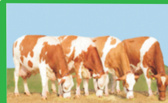
Some of the common dairy breeds in Kenya

Deputy Vice-Chancellor (Research and Extension)