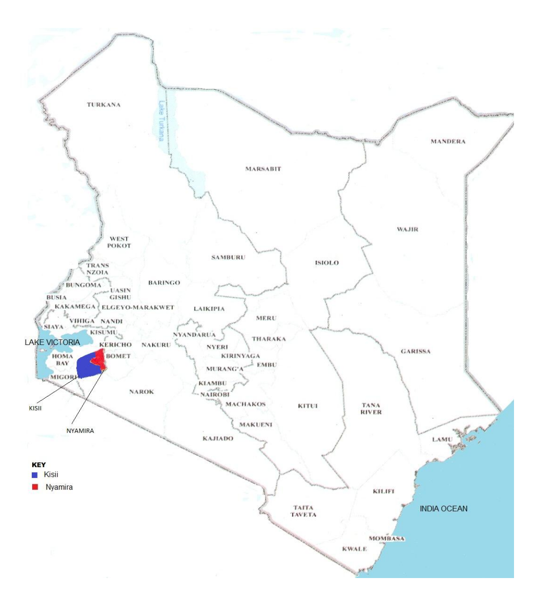
Figure 3: A Map Showing the Location of Study