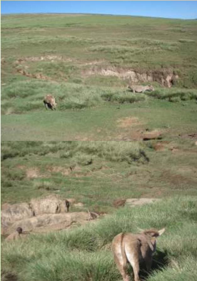
Entiyani Site before rehabilitation in 2012

Before the site was rehabilitated it used to be frequented by livestock and other domestic animals that posed danger of zoonotic diseases and water contamination. Below are the photos before and after rehabilitation members.