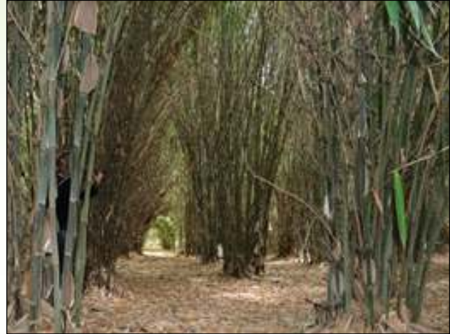
2023 forest showing mature bamboo trees

As part of its contribution to the campaign against climate change and mitigating the effects, the university has been planting on average 10,000 tree seedlings