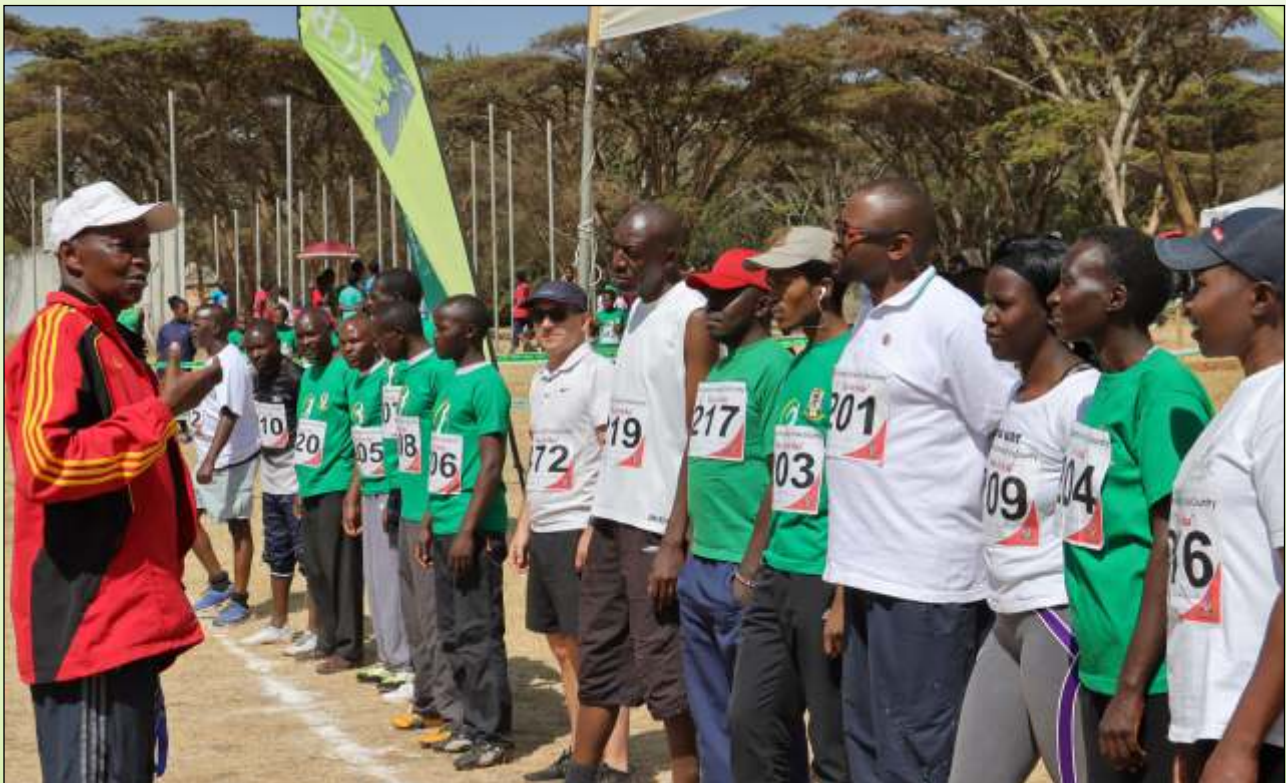
Participants during the 8th Edition of the Mau-Egerton University Cross Country on February 2023