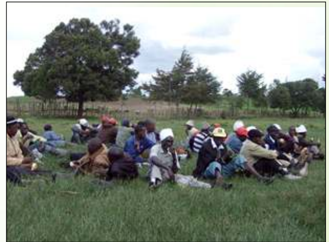
Community environmental sensitization seminars conducted in the year 2012