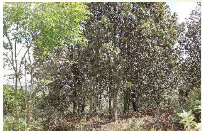
Entiyani Site after rehabilitation in 2023

In the year 2015, the site was razed down as a result of an accidental fire that came from a