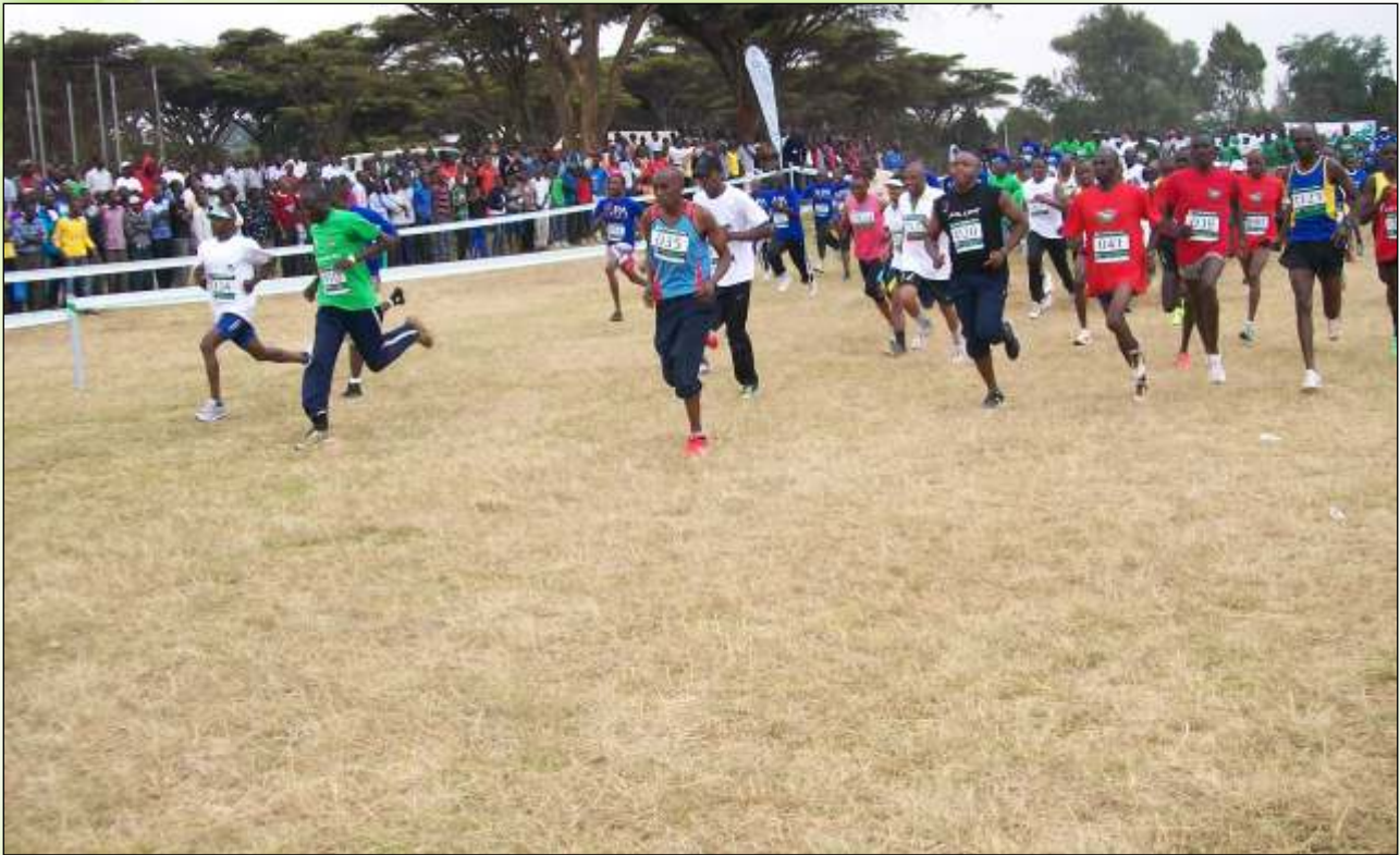
Participants during the inaugural Mau-Egerton University Cross Country on February 2014