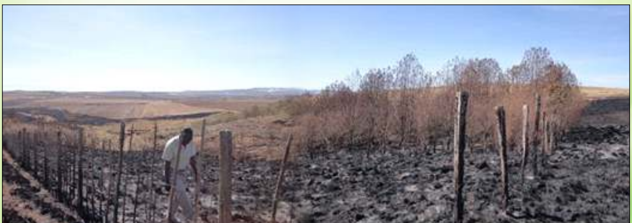
Entiyani site in 2015 after the fire incident that destroyed the vegetation

Below are some of the photos taken during that time.