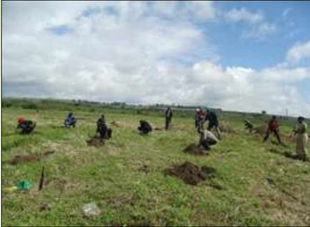
Planting of bamboo trees in 2014

Musalia Mudavadi, who participated in a tree planting exercise in 2023.