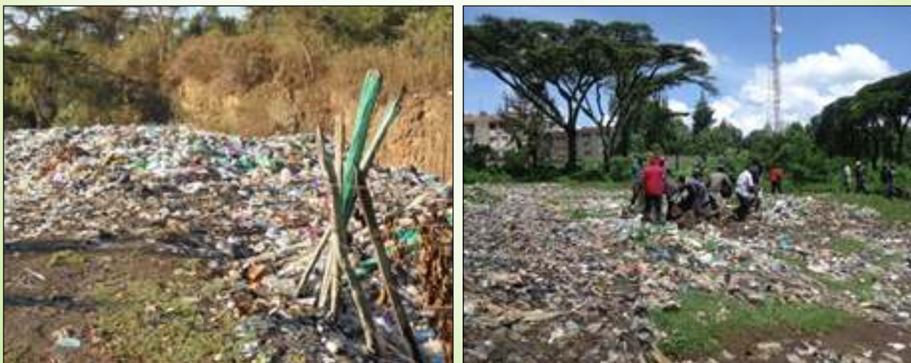
Ng' Ondu Site before rehabilitation in 2012

at this site from the community. Currently, a youth group has taken over the rehabilitated site and established a tree nursery with a capacity of 100,000 tree seedlings. Below are some photos depicting how the site was in before rehabilitation in the year 2012 and how it was last year (2023).