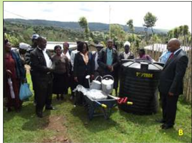
Community receiving donations in support of establishing tree nurseries (a) at St. Lwanga primary school and (B) at Likia environmental CBO by the CO-OP Bank team