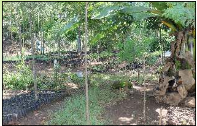
Ng'onde Site after rehabilitation in 2023