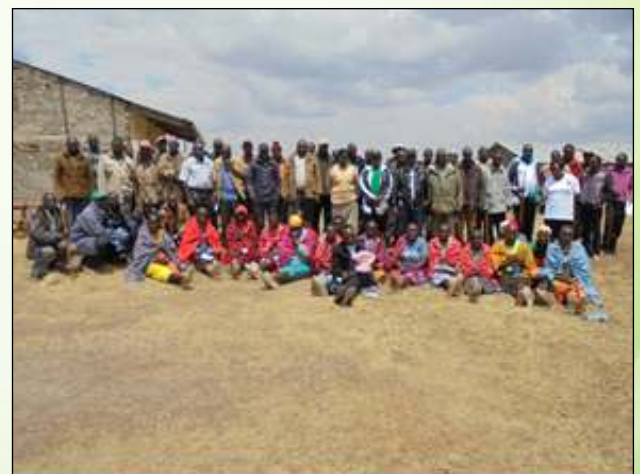
Egerton University staff educating the community at Entiyani on the importance of environmental conservation in the year 2013