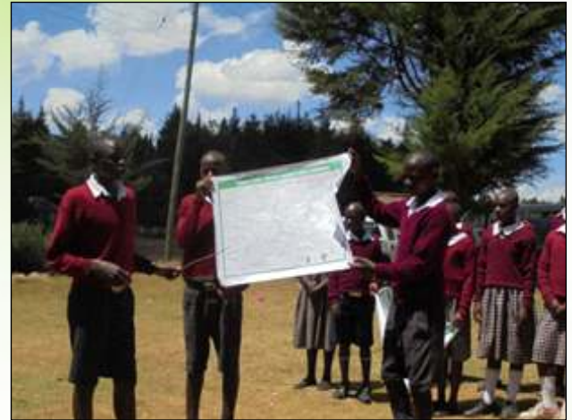
Nessuit primary school pupils demonstrating how they would like the Njoro River to look like in the future.