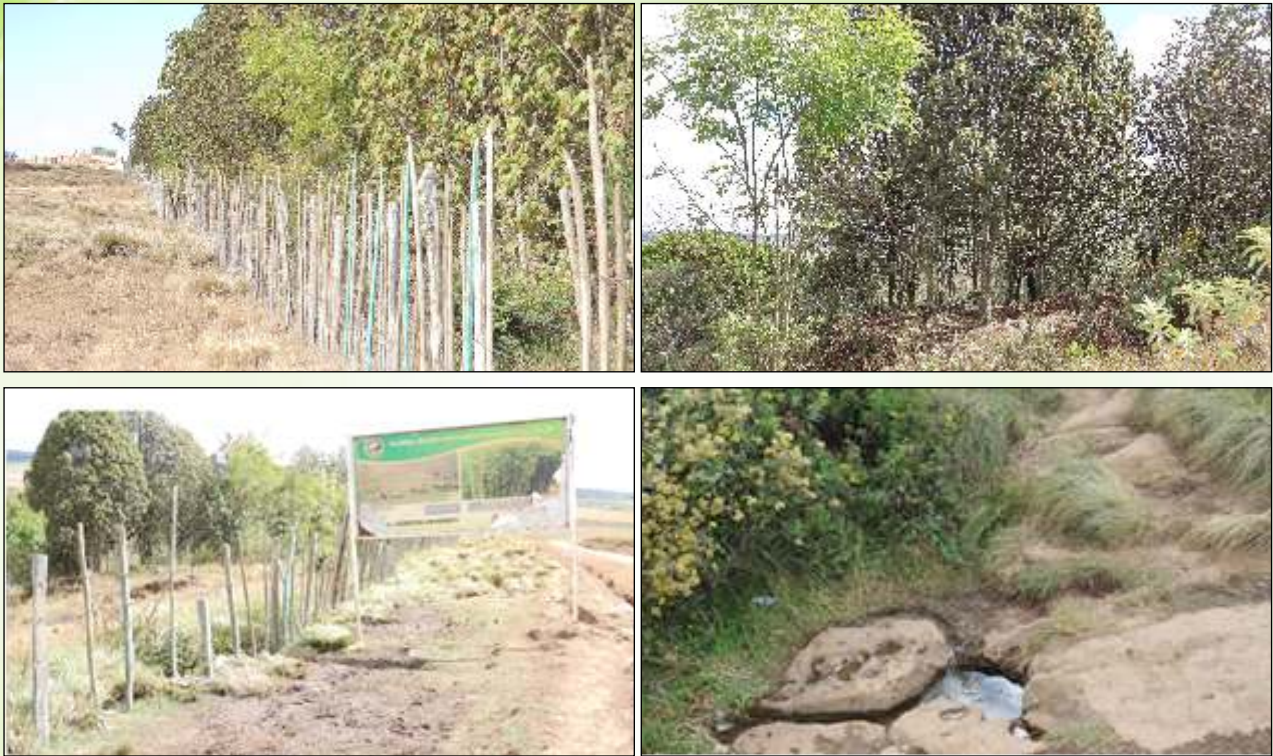
Njoro River source at Entiyani in the year 2023

Below are some of the photos taken last year 2023. Notice that the water at the source comes as a spring from the rock that flows down stream and then other tributaries join in Logoman forest.