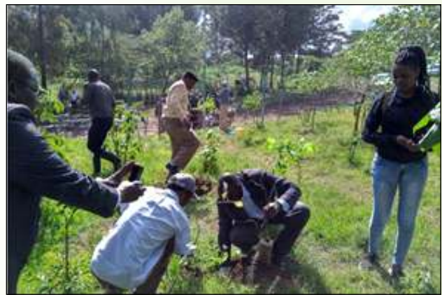
Community youth replanting tree seedlings at the Ng'ondeu Site in 2015

The university has held 30 plus community environmental sensitization seminars and partners meetings. Primary school